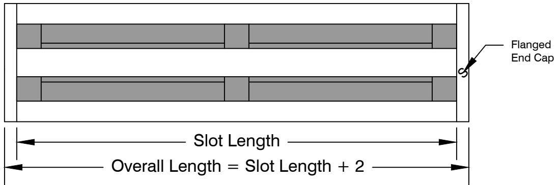
FLANGED END CAPS